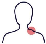
Swollen Lymph Nodes