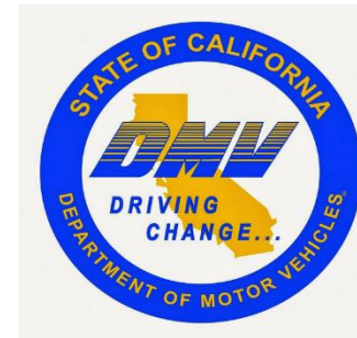
Dept. of Motor Vehicles